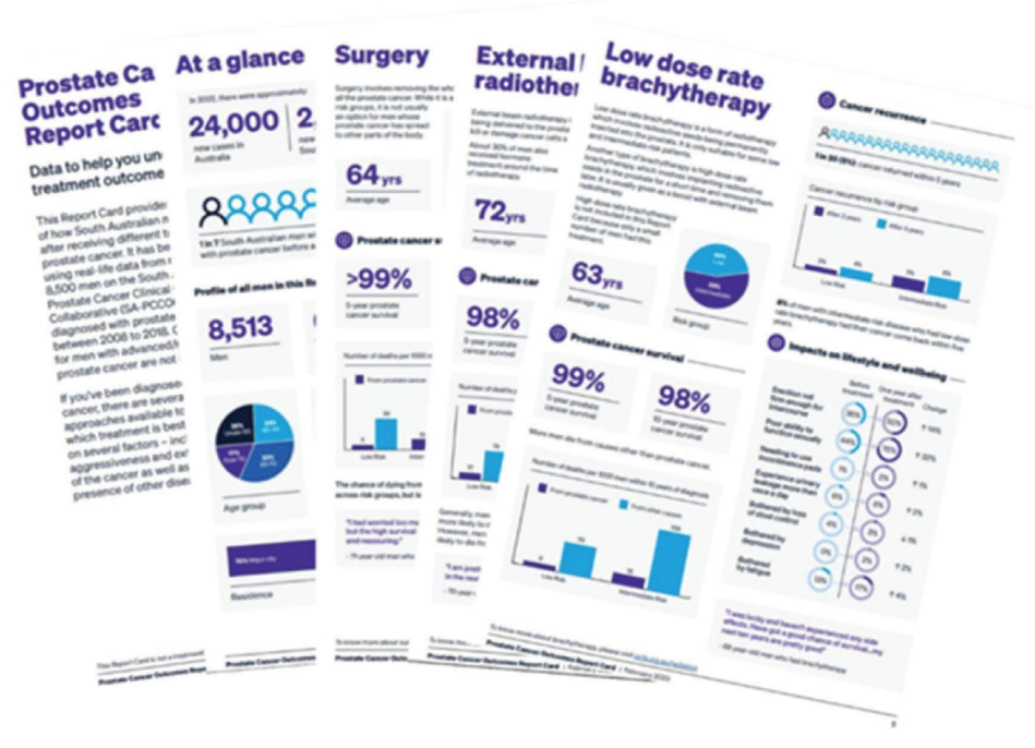
FIGURE 2: The Report Card.

definition of the treatment, group characteristics, survival rates, cancer recurrence (where applicable), impact on lifestyle and wellbeing, and quotes from personal experiences. Pages 9-10 include a summary emphasising "A positive prognosis" and provide links to support and information services relating to mental health, treatments' side effects, and sexual health. The last page covers glossary of terms, people involved in the development of the Report Card, and the funding source (Figure 2).